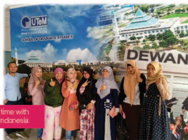
Picture session during the break time with several friends from Indonesia

I feel that 2 days in workshop activity, we get a lot of PhD knowledge, how about for 2 years? I cant imagine how much can I get here, from UTeM. Hopefully, I can successfully bring PhD title from UTeM with proudly.