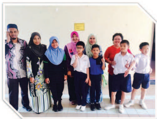
A day with Autism Children.

I embarked on the journey of my PhD on September 2016 under "Hadiah Latihan Persekutuan" scholarship. I am grateful for this precious opportunity after 3 years of graduating Master from UTeM. Yet, the journey throughout a PhD is hardly perpetually a logical and constrict roadway. And between the contort and pivot and backtracking you will be contrived to grasp, you can certainly overlook vision of your objectives and ground for beginning out on the journey. During the early days, I explored several potential topics where I would later choose one, which best suit my interest and has the potential to be developed into a PhD thesis. I decided to study the effect of virtual reality technology in learning mathematics, focusing on problem solving learning among autism children.